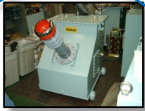
100kV/20kVA Transformer for high voltage test