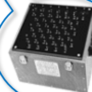
Auxiliary voltage transformer