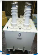
High Voltage Switch Unit for double Circuit