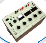
Transformer Turn ratio test set